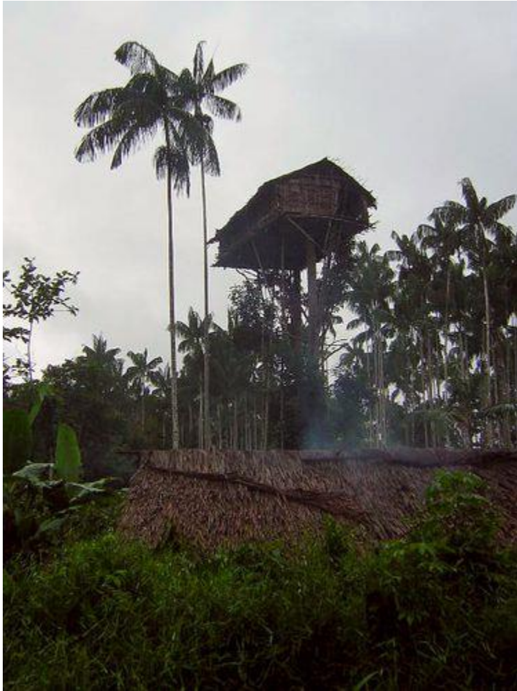
Photo Credit: ♪ ~ from Jayapura, Indonesia (Korowai Treehouse), CC BY 2.0